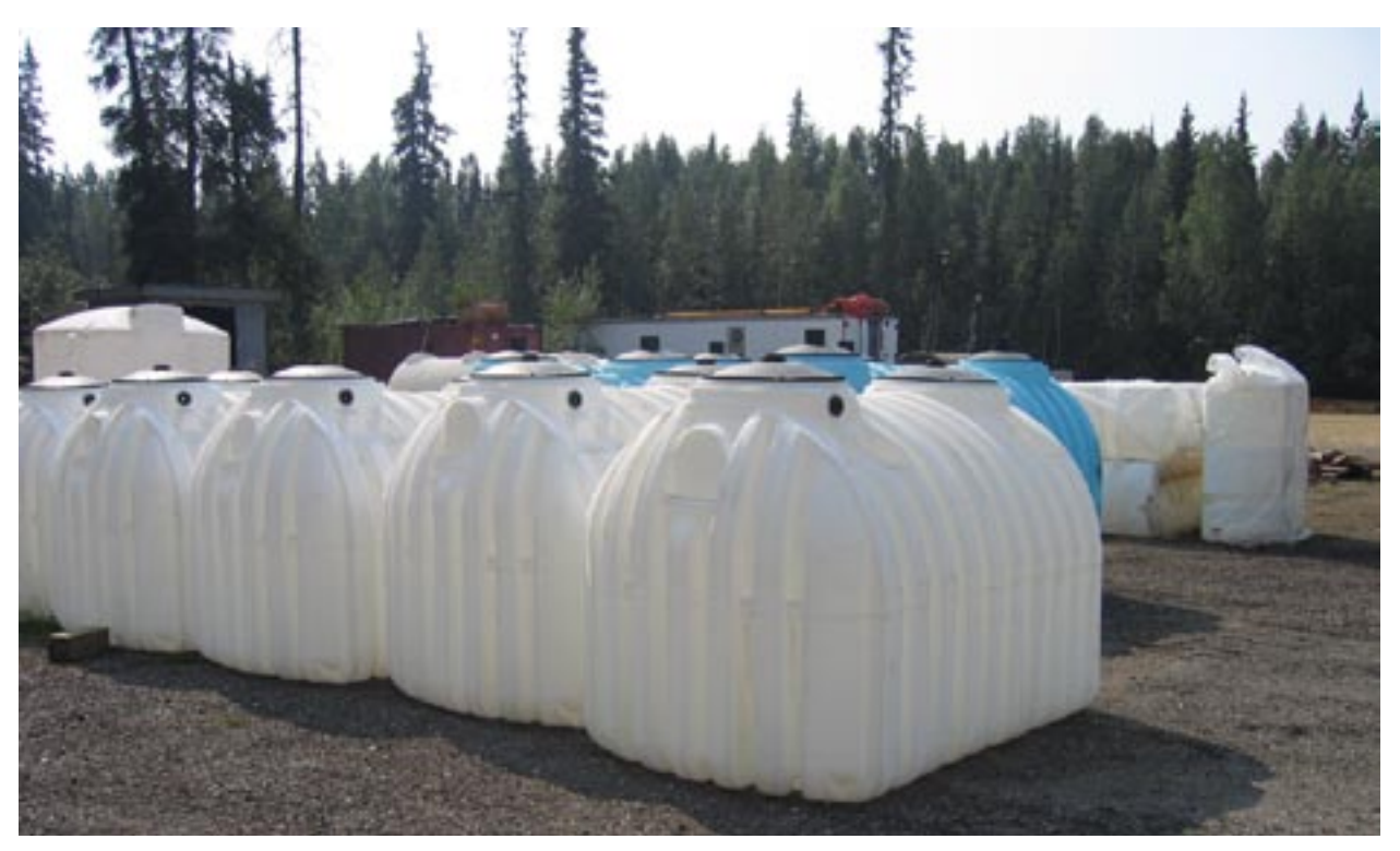
Figure 2 M & M Tanks —High density polyethylene tanks. Tanks shown are ~1,500 gallons.

ease of filling and protection from freezing and pollution. You should place the tank in a location where truck access for fill-ups is as simple and direct as possible. The folks at Water Wagon have also noted that auto-fill customers and any customers who expect winter service, should keep their driveway and fill pipe area well maintained in winter. Driveways that aren't plowed are difficult and often create obvious problems. The trucks are wide, long, and heavy and they do not have 4-wheel drive in most cases. These trucks require a 10-foot-wide clear driving surface and extra room to maneuver around curves, trees, and obstacles. The situation could become so difficult that they won't attempt to deliver your water in marginal conditions. The run to the tank from the truck should be 30 feet or less. You should locate the tank as close as possible to a utility room and be able to see the tank location from the truck pumping area so that the driver can see the tank and vent. Putting the tank